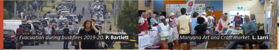
Evacuation during bushfires 2019-20. P. Bartlett